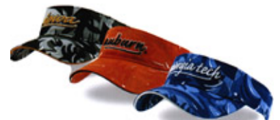
Product ID VIS-SPIRIT1

Any logos shown above are the properties of their registered owners