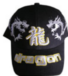
Product ID CAP-DRA1