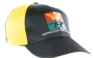
Product ID CAP-COMB9