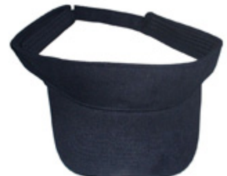
Product ID VIS-CLASSIC1