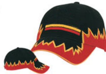
Product ID CAP-FLAME DE 3