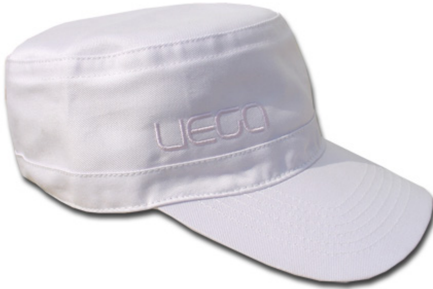
Product ID CAP-U CLASSIC white fabric & pink embroidery

Combine your requested fabric & visor colours with embroidery, print screen and your labels: