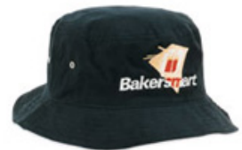
Product ID BUC-CLASSIC2