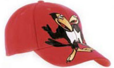
Product ID CAP-CLASSIC4