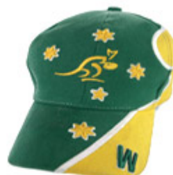
Product ID CAP-FAN1