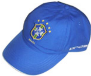
Product ID CAP-BRA4