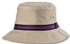
Product ID BUC-BAND1