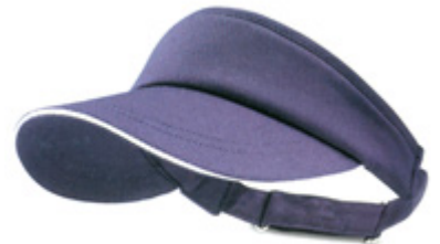
Product ID VIS-SUN1