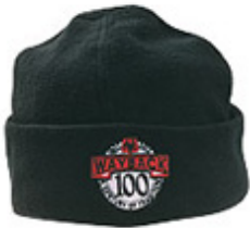
Product ID VAR-POLAR1 Micro Fleece