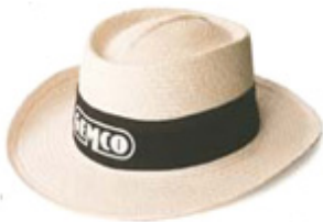
Product ID VAR-CLASSIC1 Palm Straw