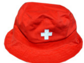
Product ID BUC-SW11 Fan Hat with other country flags, colours available

Any logos shown above are the properties of their registered owners