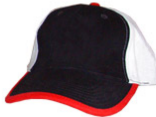
Product ID CAP-COMB3