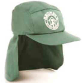
Product ID CAP-SAHARA2

Any logos shown above are the properties of their registered owners