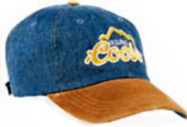
Product ID CAP-DENIM1