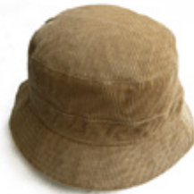
Product ID BUC-COMFY1