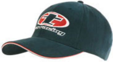
Product ID CAP-SANDW2