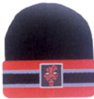
Product ID BEA-CLASSIC5