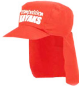
Product ID CAP-SAHARA1