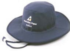
Product ID VAR-AUS2 Canvas