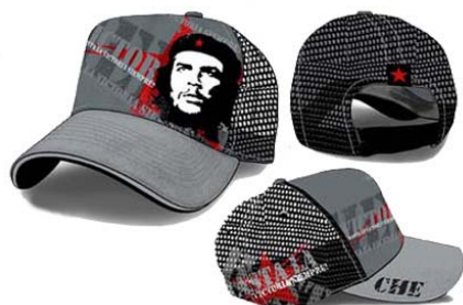
Product ID CAP-TRUCK1