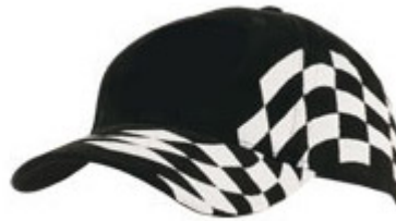
Product ID CAP-RACE1