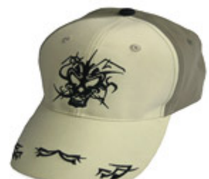
Product ID CAP-ULTRA1