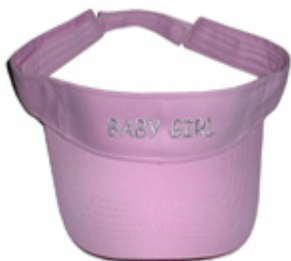
Product ID VIS-LADY2