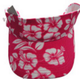
Product ID VIS-HAWAII