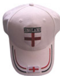
Product ID CAP-ENG1