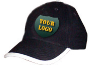
Product ID CAP-COMB2