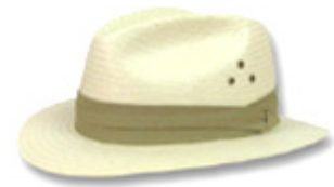
Product ID VAR-CLASSIC3 Palm Straw

Any logos shown above are the properties of their registered owners