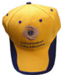
Product ID CAP-SPEC3