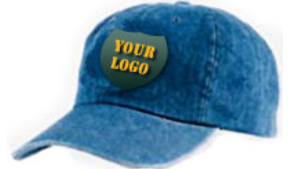
Product ID CAP-DENIM2