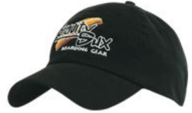
Product ID CAP-CLASSIC8