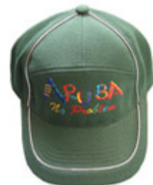
Product ID CAP-SPEC2