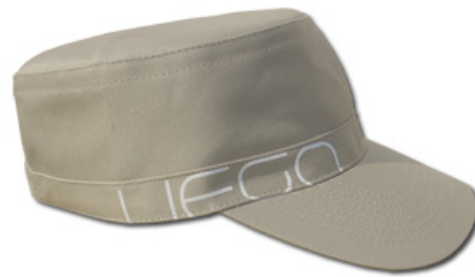
Product ID CAP-U BRAND tuffet fabric & white screen print