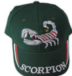
Product ID CAP-SCOR1