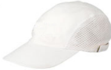
Product ID CAP-MESH3