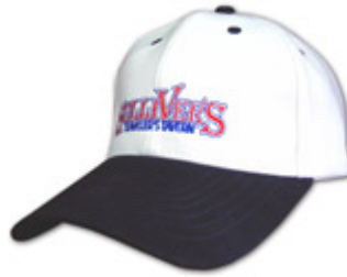
Product ID CAP-COMB7