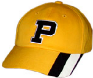
Product ID CAP-CLASSIC3