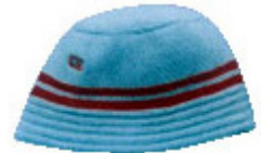
Product ID VAR-KNIT1