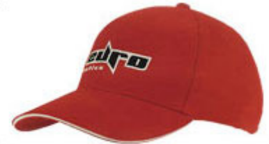
Product ID CAP-SANDW1