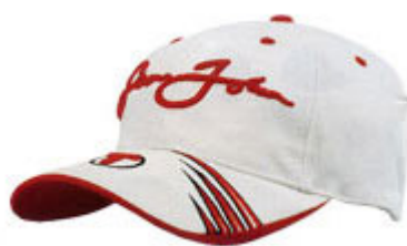
Product ID CAP-SPEC5