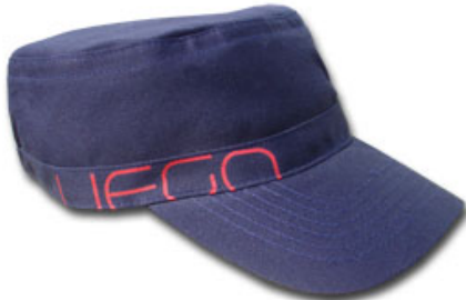
Product ID CAP-U BRAND dark navy fabric & dark red screen print