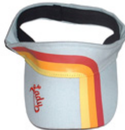
Product ID VIS-LADY1 *