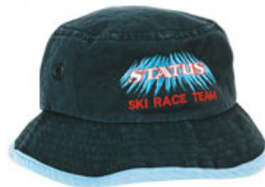
Product ID BUC-CLASSIC4