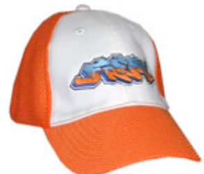
Product ID CAP-MESH1