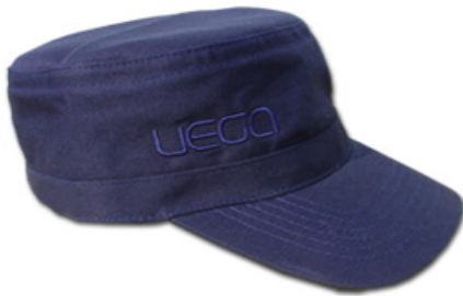
Product ID CAP-U CLASSIC dark navy fabric & dark navy embroidery