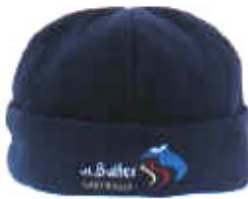
Product ID VAR-POLAR1 Micro Fleece