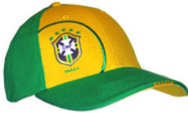
Product ID CAP-BRA1