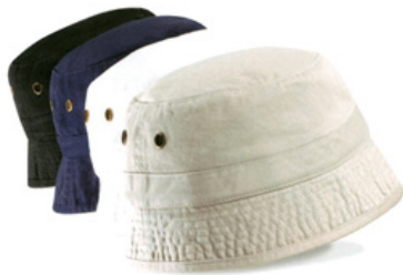
Product ID BUC-CLASSIC1

Made to Order Bucket Hat also called Fisherman or Bob Hat