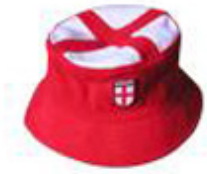
Product ID VAR-ENG1 100% Cotton Twill