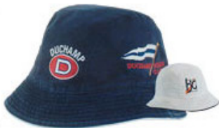
Product ID BUC-CLASSIC3