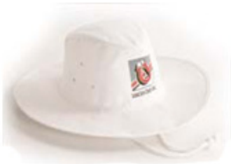
Product ID VAR-AUS1 Polyester & Cotton