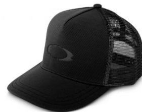
Product ID CAP-TRUCK2