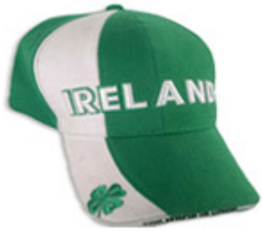
Product ID CAP-FAN2 Fan Cap with other country flags, colours available