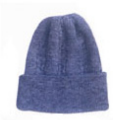
Product ID BEA-CLASSIC7