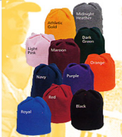
Product ID BEA-CLASSIC1