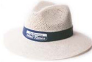
Product ID VAR-CLASSIC2 String Straw