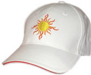
Product ID CAP-SUN1