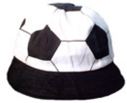
Product ID VAR-FOOTY1 100% Cotton