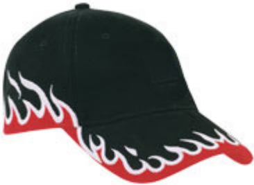
Product ID CAP-FLAME2