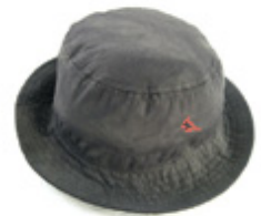
Product ID BUC-COMFY1