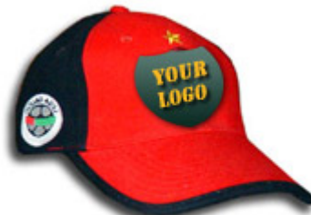
Product ID CAP-COMB6