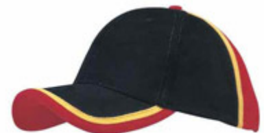
Product ID CAP-SPEC3