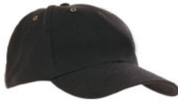
Product ID CAP-CLASSIC7