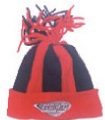
Product ID BEA-FUN1 *

Any logos shown above are the properties of their registered owners