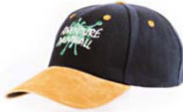
Product ID CAP-CASUAL1