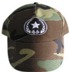
Product ID CAP-MIL1