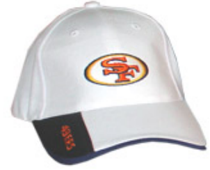
Product ID CAP-MESH2