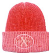
Product ID BEA-CLASSIC8 *