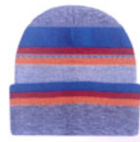
Product ID BEA-CLASSIC6