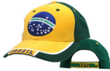
Product ID CAP-BRA2 Fan Cap with other country flags, colours available