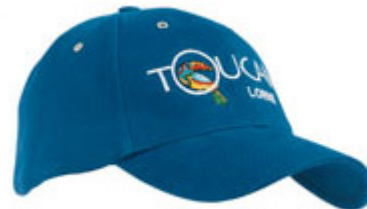
Product ID CAP-CLASSIC5