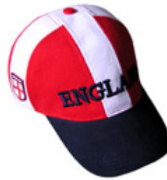
Product ID CAP-ENG2