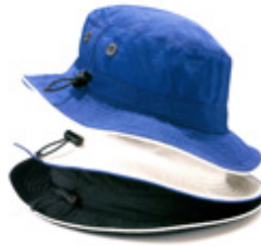
Product ID VAR-SUNHAT1 100% Cotton