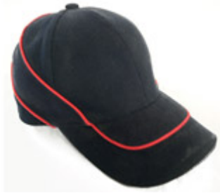
Product ID CAP-SPEC1