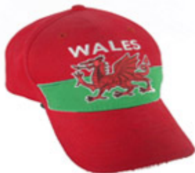
Product ID CAP-CLASSIC6