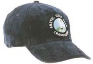
Product ID CAP-CORD2