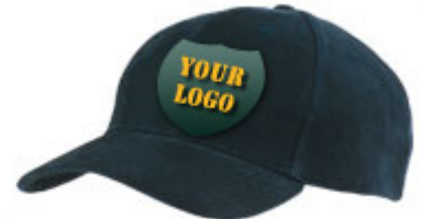
Product ID CAP-CLASSIC9