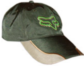
Product ID CAP-MICRO1