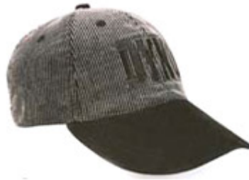
Product ID CAP-CORD1