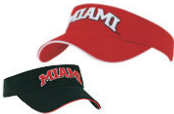
Product ID VIS-SPORT1 *