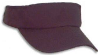
Product ID VIS-CLASSIC1