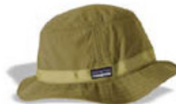
Product ID BUC-BAND2