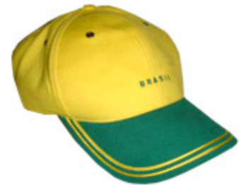
Product ID CAP-BRA3