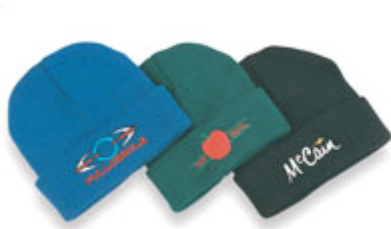
Product ID BEA-CLASSIC2