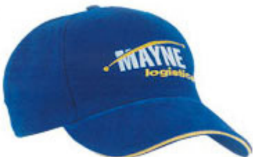
Product ID CAP-SANDW4