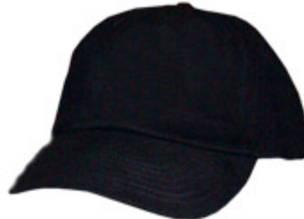
Product ID CAP-CLASSIC2