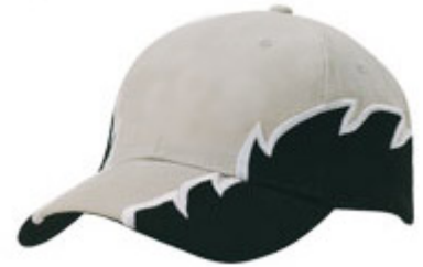
Product ID CAP-FLAME1