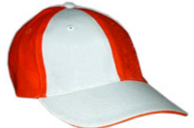
Product ID CAP-STRIFE1