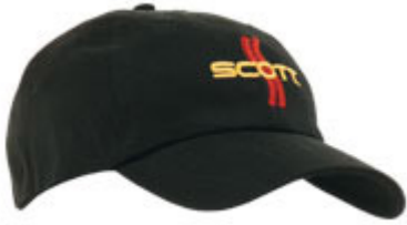
Product ID CAP-CLASSIC10