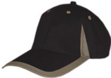
Product ID CAP-GOLF1