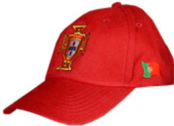
Product ID CAP-PORT1 Fan Cap with other country flags, colours available