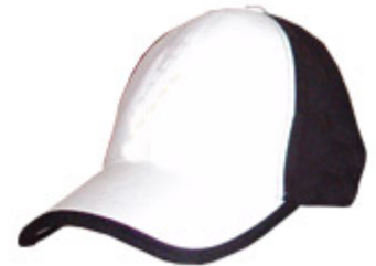
Product ID CAP-COMB4