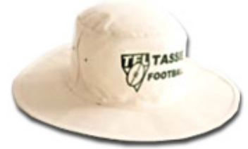
Product ID VAR-AUS3 Canvas