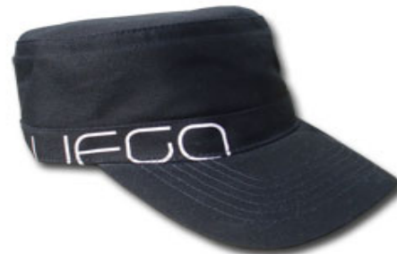
Product ID CAP-U BRAND caviar fabric & orchid tint screen print