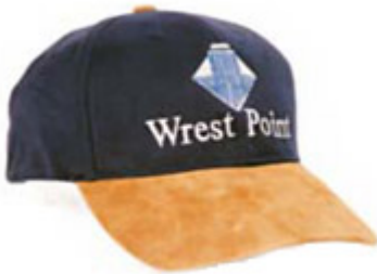
Product ID CAP-CASUAL2