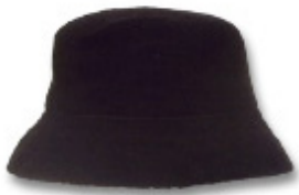
Product ID BUC-CLASSIC1