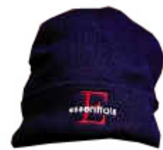
Product ID BEA-CLASSIC3 *