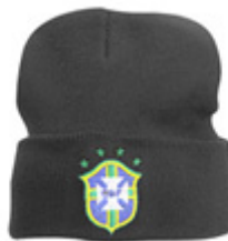
Product ID BEA-BRA1 * Fan Beanie with other country flags, colours available