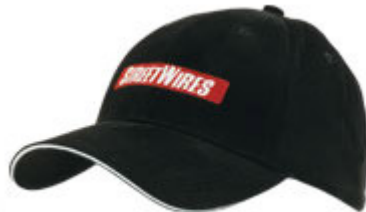
Product ID CAP-SANDW3