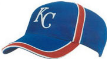
Product ID CAP-BASEB1