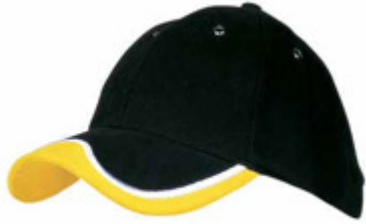
Product ID CAP-SPEC4