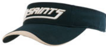
Product ID VIS-SPORT2 *