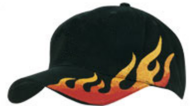
Product ID CAP-FLAME4