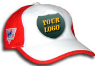
Product ID CAP-COMB5