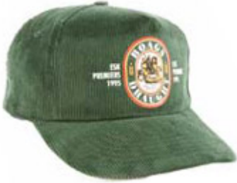
Product ID CAP-CORD3