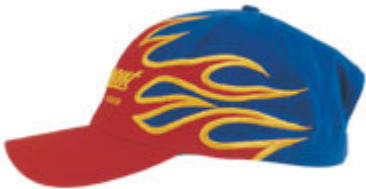
Product ID CAP-FLAME5