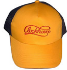
Product ID CAP-COMB8