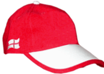
Product ID CAP-COMB1