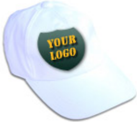
Product ID CAP-CLASSIC1