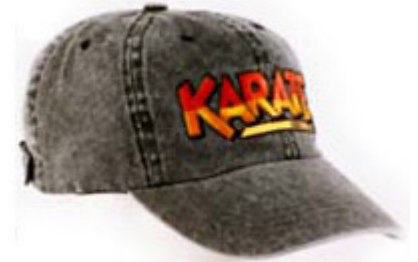
Product ID CAP-GREY1