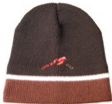
Product ID BEA-CLASSIC4 *